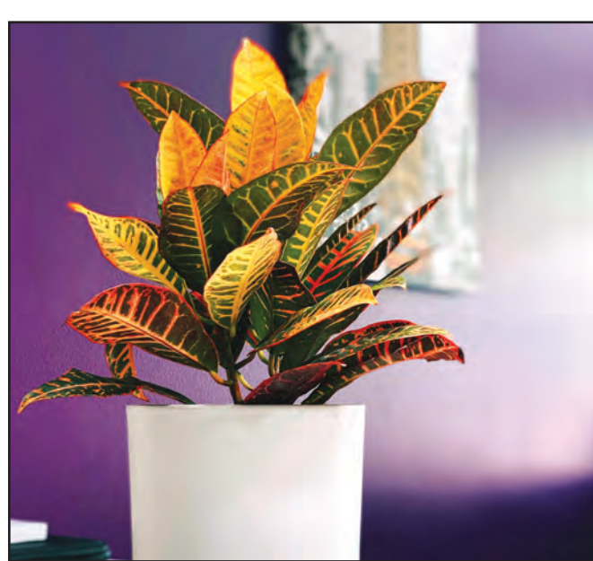
Croton plants are popular, simply for their colorful foliage.

Like most houseplants, crotons do best in well-drained, moist soil. They will need a spot in the house that receives bright, indirect light. Crotons can be moved outdoors during the summer, making a great accent or pop of color on any porch. They should be placed in an area of partial shade. The coloring of their leaves responds to the amount of light they receive; higher light will give you a more vibrant color of foliage, whereas a lack of light can cause the plant to revert to shades of green. When in too much direct sunlight their foliage turns dull and gray.